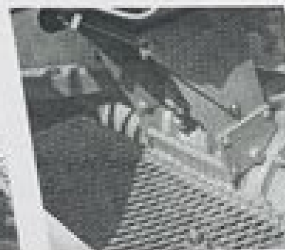
Fig. 27 - Installing Platform

3. Install platform to seat forward with pin and nut on pin, as shown in Fig. 28.