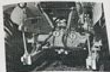
Fig. 23 - Raising Tractor to Backhoe