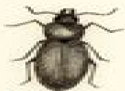
Common Black Ground Beetle 16 mm F: Grubs, Caterpillars, Insects H: Gardens (moist areas)