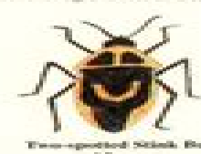
Two-spotted Stink Bug 12 mm F: Caterpillars, Larva H: Meadows, Crops, Gardens