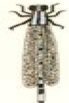
Chrysopa Fly 14 mm F: Soft-bodied insects H: Ponds, Lakes