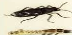
Tiger Beetle & Larva 20 mm F: Small insects H: Sandy areas, Forest edges