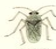
Dandelion Bug 12 mm F: Aphids, plant bugs H: Gardens, Meadows