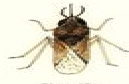
Big-eyed Bug 8 mm F: Aphids, small insects H: Meadows, Gardens