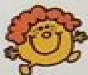
Madame EN RETARD