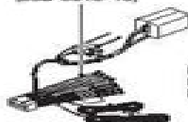
DC cord (E30-6615-15)