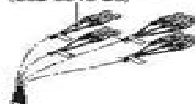
Remote controller (A70-2063-15)