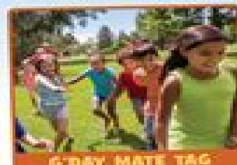
G'DAY MATE TAG