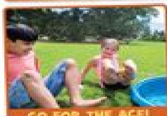
GO FOR THE ACE!