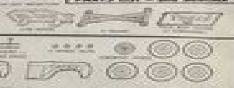
PARTS LIST - PICKUP

FOR CHECKING PARTS SET AT HOME LEFT-BELOW YOUR ALICE. MAY ASSISTING AND SUBSTITUTING IN THE FOLLOWING DIAGRAMS.