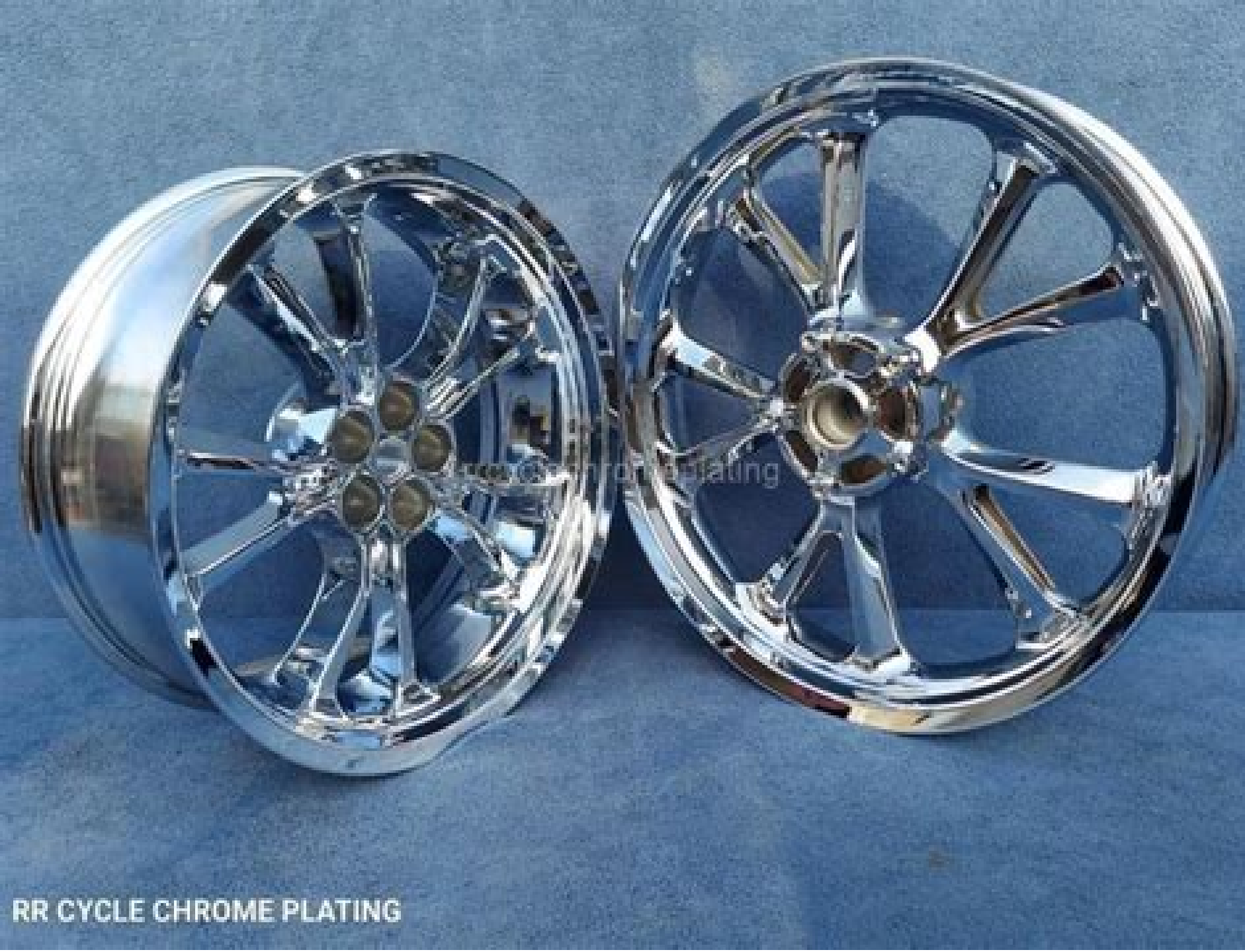
RR CYCLE CHROME PLATING