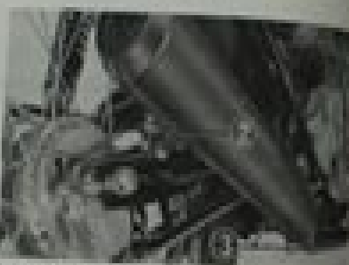
Fig. 2-29 (A) Screen (B) Cover plate (C) Drain plug