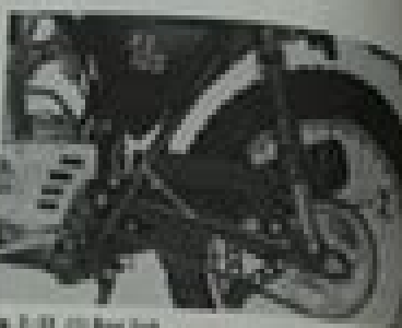
Fig. 2-28 (A) Rear fork (B) Rear shock absorber