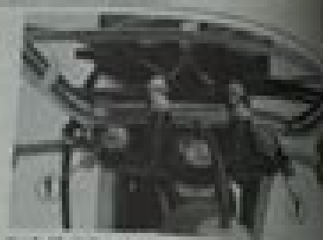
Fig. 2-27 (A) Front fork tube