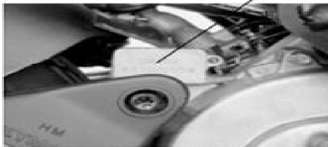
Location of Engine Serial Number