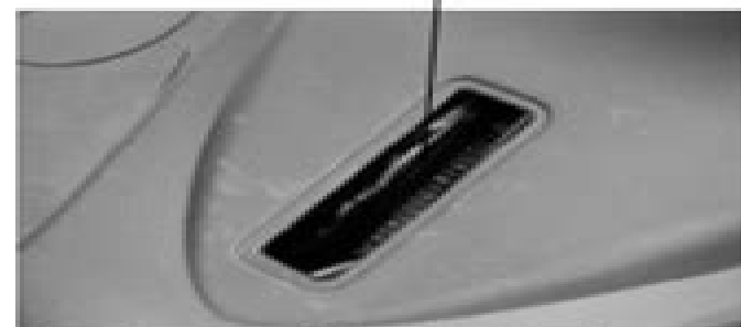
Location of Frame Serial Number