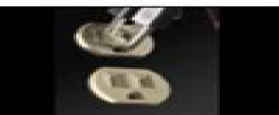
115 Volt AC Auxiliary Power

Compare These Innovations – Make the Professional's Choice™!