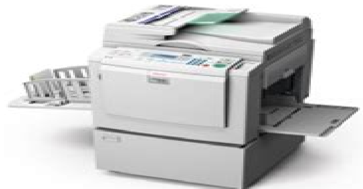
Priort™ DX 3243/DX 3443