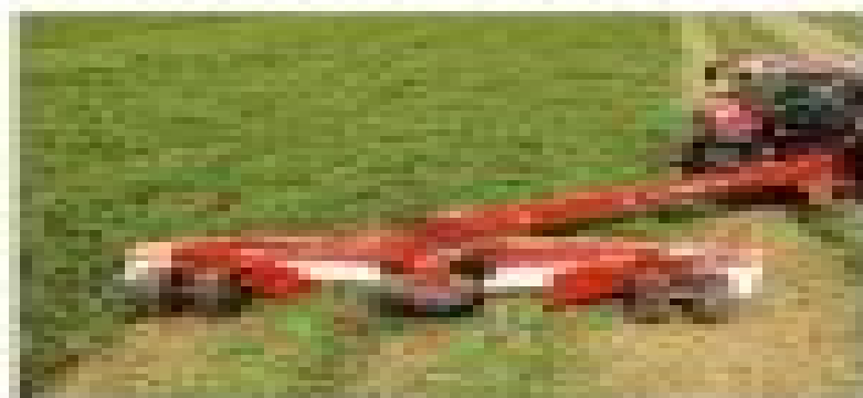
Working in the field