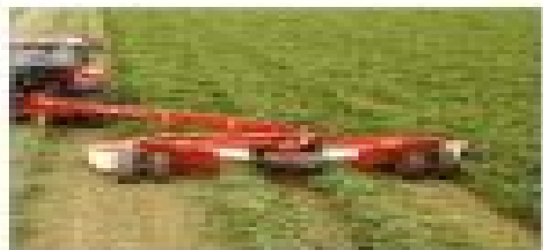
Working in the field