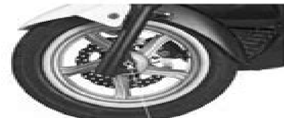
Front Axle Nut