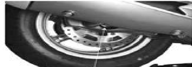
Rear Axle Nut