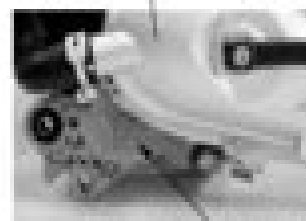
Location of Engine Serial Number