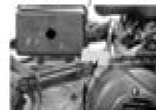
Location of Engine Serial Number