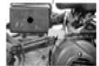
Location of Engine Serial Number