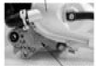
Location of Engine Serial Number