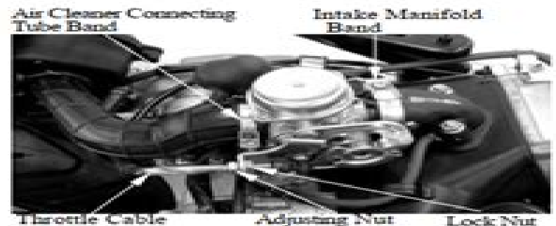
Air Cleaner Connecting Tube Band

Loosen the throttle cable adjusting nut and lock nut, and disconnect the throttle cable from the carburetor. Loosen the carburetor intake manifold band and air cleaner connecting tube band screws and then remove the carburetor.