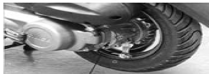
Oil Check Bolt Hole