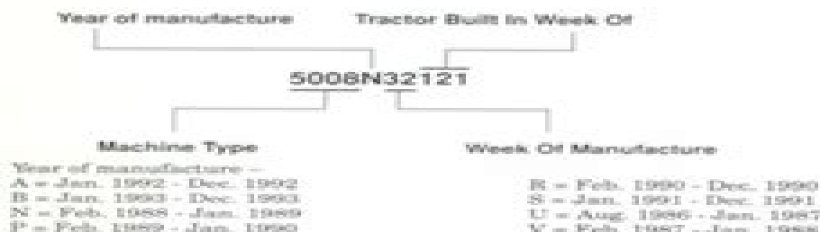
Fig. 3—The tractor serial number identifies machine type, year of manufacture, week of manufacture during specific year, and specific unit manufactured during that week. The example shown identifies a two-wheel-drive 390 tractor which was the 121st tractor manufactured during the 32nd week of 1988.

Machine type — 5006 M-F 375 2WD 5007 M-F 375 4WD 5008 M-F 390 2WD 5009 M-F 390 4WD 5010 M-F 398 2WD 5011 M-F 398 4WD 5206 M-F 383 2WD