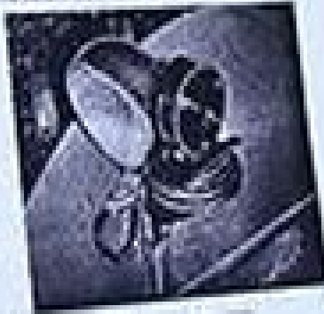
Fig. 12 - Exhaust Pipe Cap

A cap is available for the exhaust pipe. This cap is made of stainless steel and is used to protect the pipe from dirt and debris.