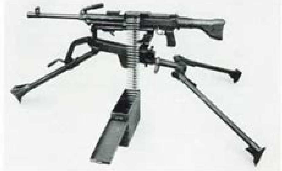
SIG machine gun MG 710-2 on tripod