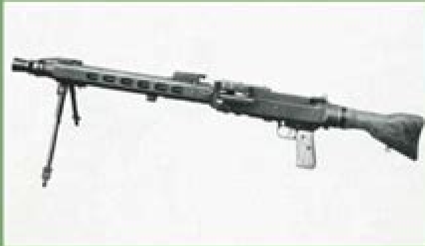
SIG machine gun MG 710-1 on tripod