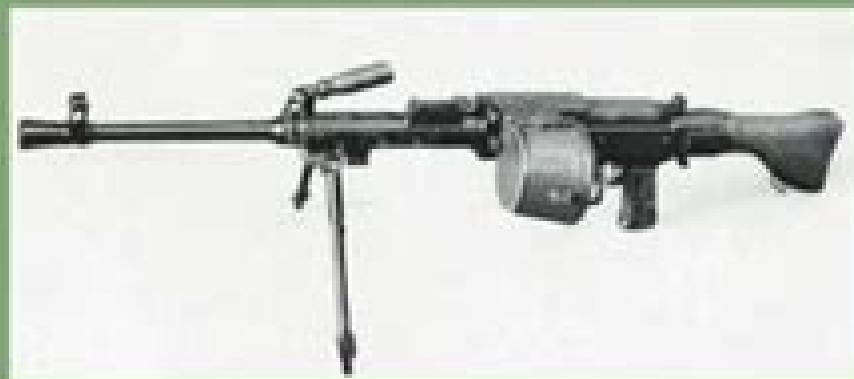
SIG machine gun MG 710-2 on tripod with stock extended