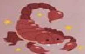
ARCHÉTYPE Le scorpion