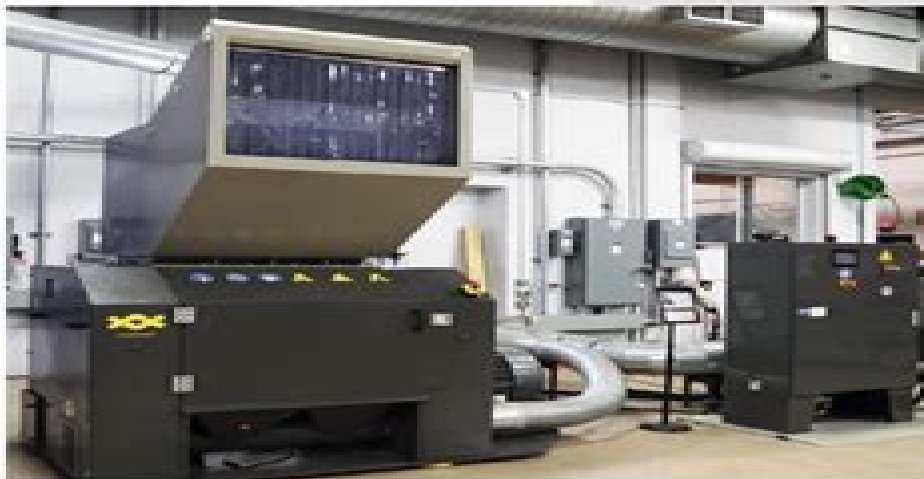
Figure 1 T5090 Tangential Granulator with HMI Control Tower.