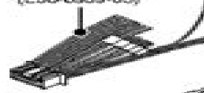
* DC cord (E30-6940-05)