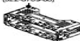
* DC cord (E30-6939-05)