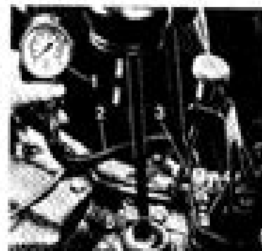
© 2004 by John Wiley & Sons, Inc. All rights reserved. This article is a U.S. Government work and, as such, is in the public domain in the United States of America.

Im der Kapfwallenstation 14 bis 1000 l/min eingeleitet, dann entleert die Röhre vom Lufteinhalt der Kapfwaile 1 direkt in den Kapfwallenstempel, der mittels Kolbenwirkung kreisförmig mit der Kapfwaile verbunden ist (vgl. Bild 5). Doppelstempel 14 und Stempel 16 des Ventils sind fest mit dem