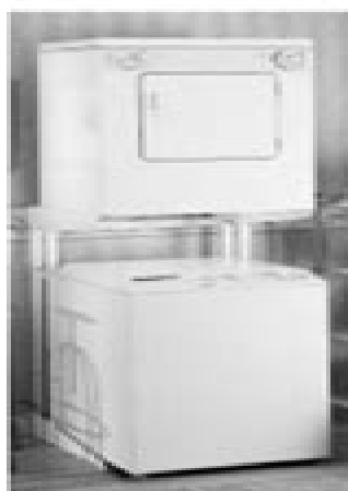
Shown with optional Stack Stand