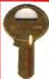
Master Lock M1