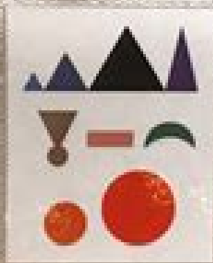
parts of speech