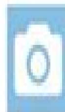
Foto 3 Mpx