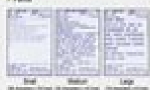
Three font sizes are available for convenience of the operation.