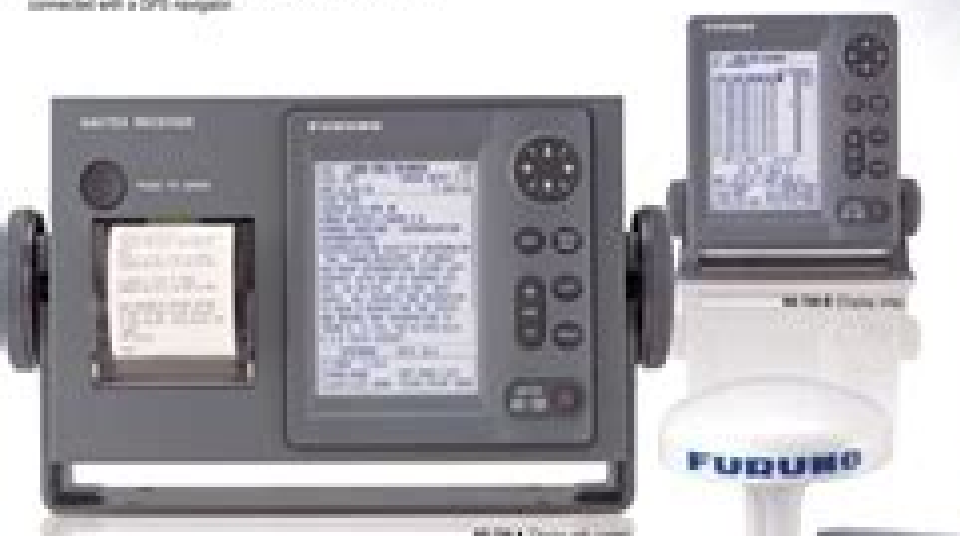
Dual-channel NAVTEX Receiver

The NX-700-A consists of a receiver, display with printer and antenna unit. The NX-700-B has a low profile, stylish display without a printer, receiver and antenna unit. The compact omnidirectional antenna requires no grounding because it is a loop antenna. In addition, the antenna incorporates a high-performance preamp within the compact body, which gives reliable and uninterrupted reception without an extra whip antenna.