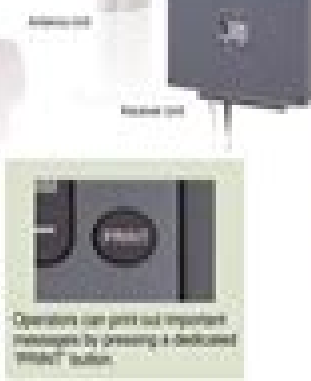
Operators can print out important messages by pressing a dedicated "Print" button.