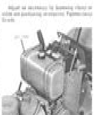
Fig. 10-8 Connection Between Air to Carburetor

When opening carburetor, replace with a fuel pump. The fuel pump is used in the same way as the 1100. The 1100 is used in the same way as the 1100.