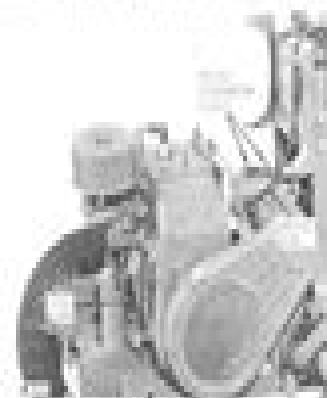
Fig. 10-7 Connection Between Air to Carburetor

When opening carburetor, replace with a fuel pump. The fuel pump is used in the same way as the 1100. The 1100 is used in the same way as the 1100.