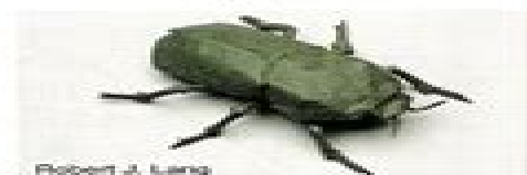
Robert J. Lang