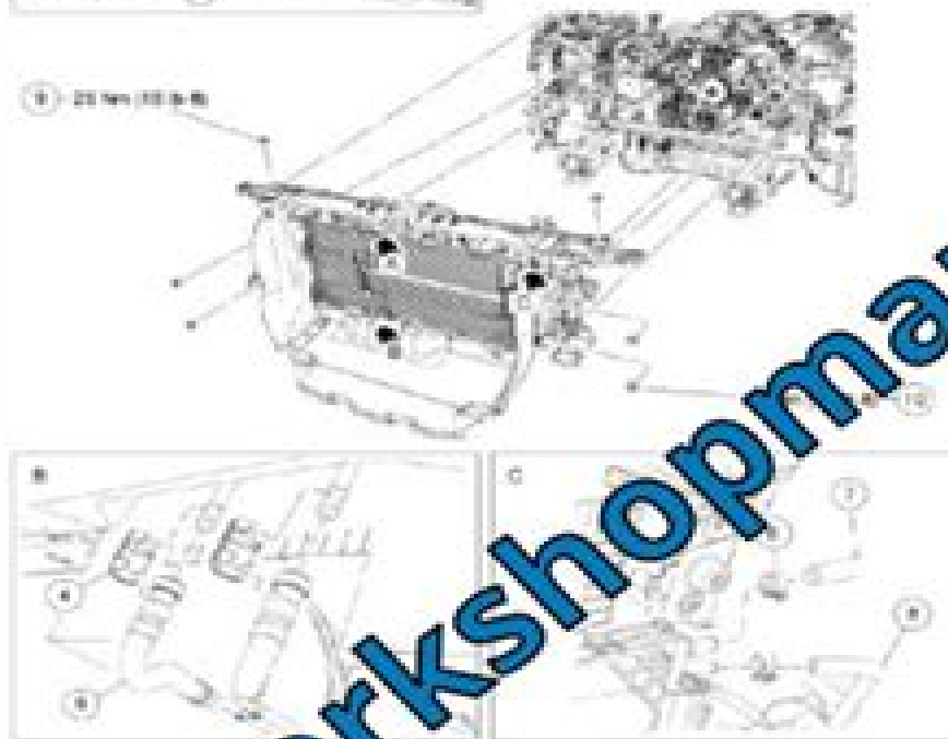
Fig. 14: Identify the Hood Latch Assembly Components With Torque Specifications