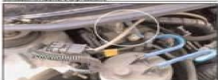
Collegamento riduttore di pressione

Poiché il metano subisce un forte abbassamento di temperatura a causa della sua espansione dovuta al calo di pressione, il circuito di raffreddamento motore ha una derivazione che permette al liquido refrigerante motore di riscaldare il gruppo riduttore di pressione in modo da evitare eventuali inconvenienti dovuti al calo di temperatura.