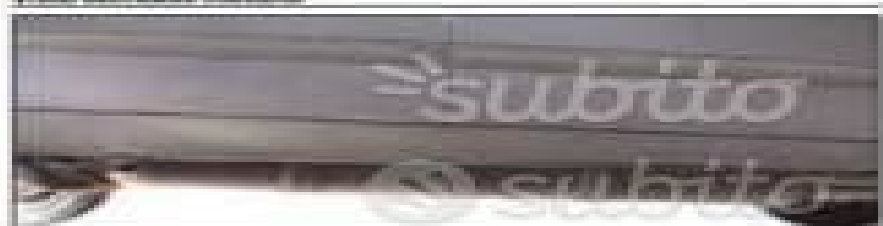
Auto bombola metano