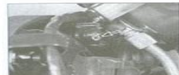
10.3 There's a horizontal adjuster for each headlight (arrow)