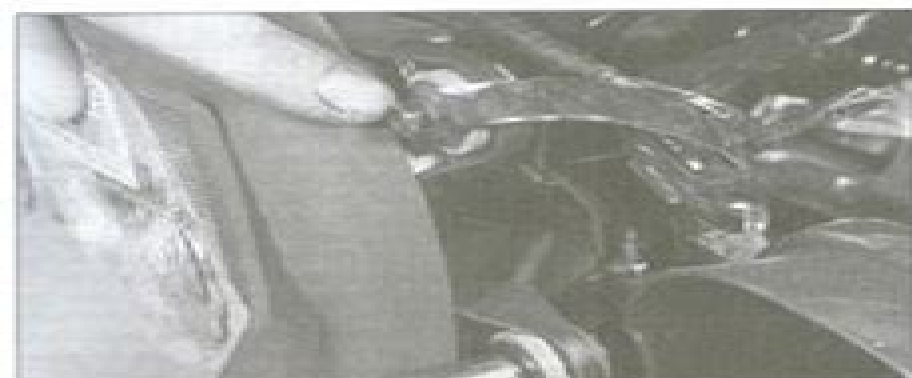
9.2a Note the locations of any wiring harness retainers at the upper left corner . . .