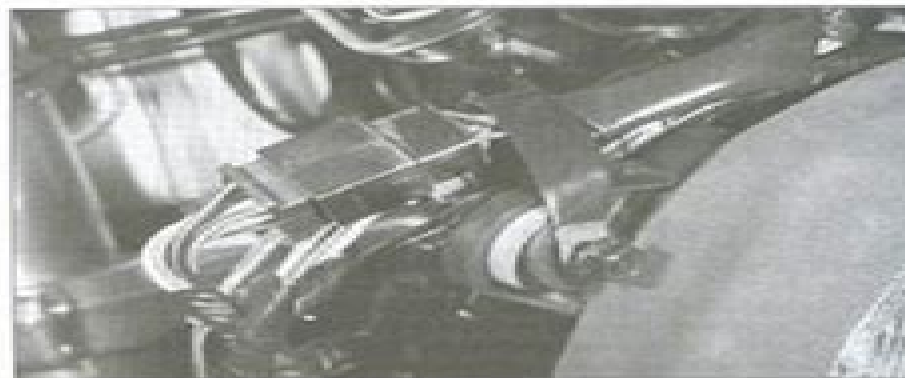
9.2b . . . and at the upper right corner