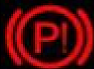
Electric Park Brake and Fault Indicators