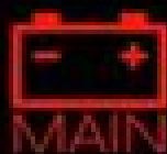
Charging System Trouble Light