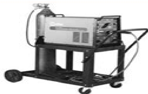
Universal Carrying Cart and Cylinder Rack #042 934

This cart adds convenience to the Econotig package. The power source mounts securely to the top, and a cylinder rack supports the argon cylinder. The bottom tray can hold electrode leads or welding hood, gloves, etc. Cylinder rack will accommodate 6–9 in (152–228 mm) diameter, and 24–56 in (610–1422 mm) high cylinders. The cart also supports five standard TIG filler metal tubes and one Stick welding rod tube. Net shipping weight is 69 lbs (31 kg).