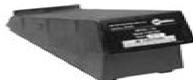
RFCS-14 Foot Control #043 554

Miniature hand control for remote current and contactor control. Dimensions: 4 in (102 mm) x 4 in (102 mm) x 3-1/4 in (82 mm). Includes 20 ft (6 m) cord and 14-pin plug.