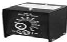
RHC-14 Hand Control #129 340

North and South rotary-motion fingertip control fastens to TIG torch using two Velcro® straps. Includes 28 ft (8.5 m) control cord. Great for applications that require a finer amperage control.