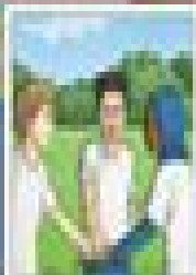
Teamwork and Communication

1 What is meant by that? How do you share your experiences during a game?