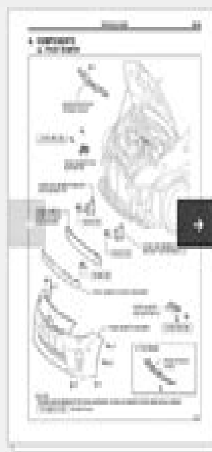
PriusDash etc. Components(1).pdf