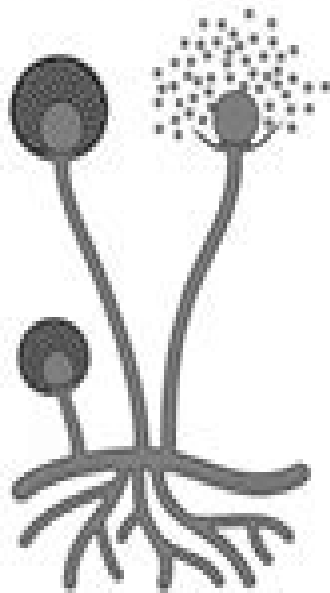
Rhizopus (Bread mold)

- classification, characteristics, structure and types