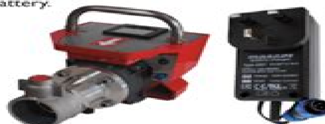
The Flowmaster 250DL MK2 and External Battery Charger