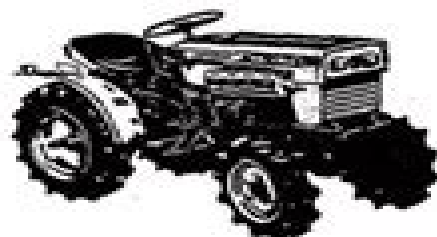
4YM135D 13HP Wheel Drive