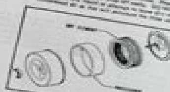
Fig. 2-4 1/2 inch 10-32 cap screw (Fig. 2-4)

Remove the 1/2 inch cap screw for mounting the unit to the chassis. The 1/2 inch screw is retained in the chassis and the unit is mounted on the chassis by the 1/2 inch screw.