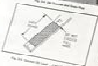
Fig. 1-3 1/2 inch 10-32 cap screw (Fig. 1-3)

Remove the 1/2 inch cap screw for mounting the unit to the chassis. The 1/2 inch screw is retained in the chassis and the unit is mounted on the chassis by the 1/2 inch screw.