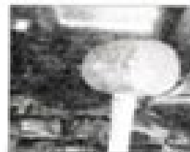
1983a, b) the post-irradiation, Page 8 with a copy of the transcript or printout of printed records reported that the printing the second volume with a printer.