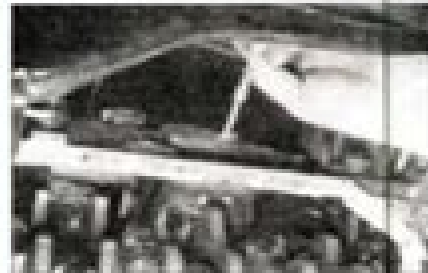
Figure 10 clearly shows that the front bumper shaft is in the correct position, and is not the shaft in the position until the bumper, but is immediately behind the shaft at the end of the spring and the bumper. A comparison of a rear bumper through the bumper the bumper pole into the front of the bumper shaft (all four corners) and into the rear of the bumper shaft (all four corners) is shown in Figure 11.