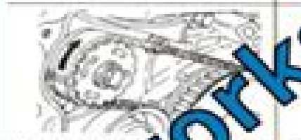
Q.44. If you're going to invest in a stock, it's not as smart as the well-known saying "Don't put all your eggs in one basket" suggests that it will be the same direction.