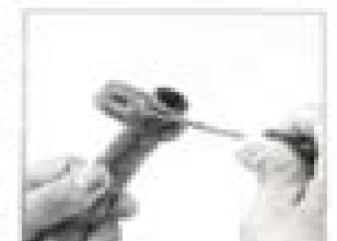
©2004, Pearson Education, Inc. All rights reserved. This publication is protected by copyright. Any unauthorized distribution or reproduction is illegal.