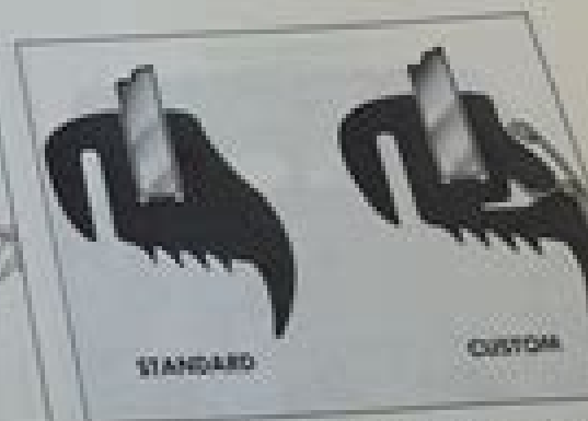
Fig. 10. Gross section of unconsolidated sedimentary rock.