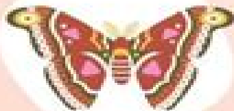
Un papillon de nuit .