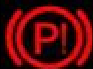
Electric Park Brake and Fault Indicators