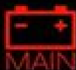
Charging System Trouble Light