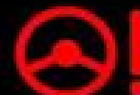
Power Steering Trouble Light