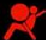
SRS Air Bag Indicator