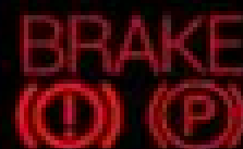
Brake Trouble Light