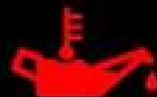
Oil Warning Light