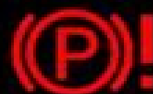
Electric Park Brake and Fault Indicators