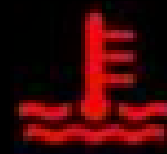
Temperature Warning Indicators