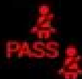
Seat Belt Reminder Indicator