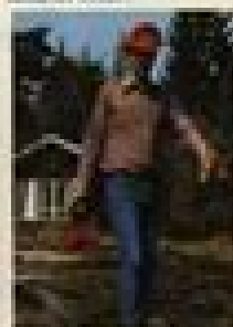
Styr och säkerhet

Jonsereds 510SP har flera funktioner som gör den till en verklig allroundsåg. Den är byggd för att vara lätt att använda. Den är byggd för att vara lätt att använda. Den är byggd för att vara lätt att använda.