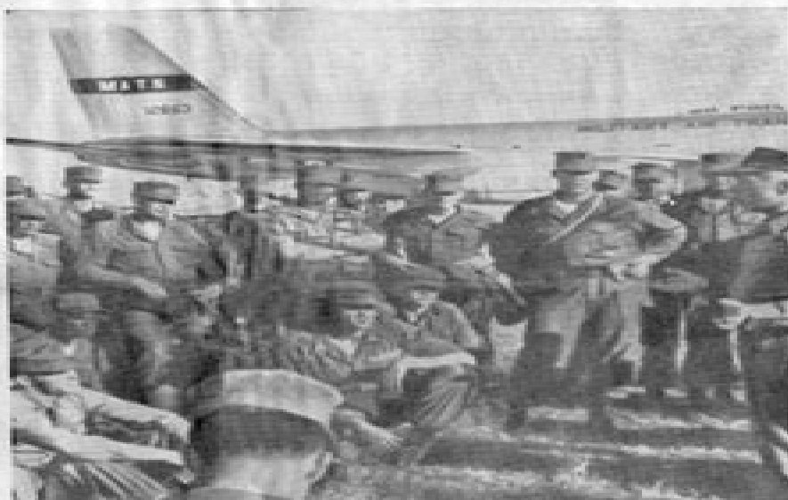
Des soldats russes aperçus derrière le mur de Berlin.

(Toutes nos informations en pages 4, 5, 7 et 8)