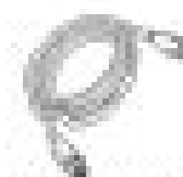
USB Interface Cable

Das Personal Storage-Produkt 3000LS von Maxtor ist abwärtskompatibel und für den Einsatz mit aktuellen Computersystemen geeignet, die über integrierte USB 1.1-Anschlüsse verfügen. Falls Ihr Computer keine integrierte USB 2.0-Schnittstelle besitzt, benötigen Sie eine USB 2.0-PC-Adapter-Card, um USB 2.0-Geräte übertragen zu können.