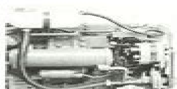
Freshwater cooling extends engine service life, reduces the risk of corrosion and also provides for a hot water outlet.