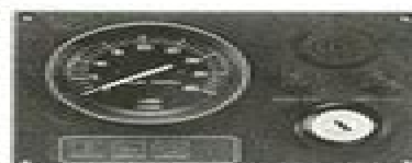
Instrument panel with tachometer and alarm display for oil pressure, coolant temperature, and charging.